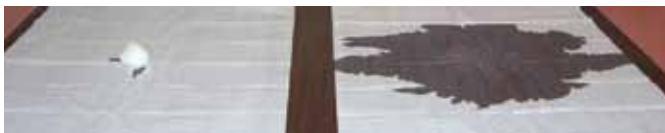
Air Cell Controlled